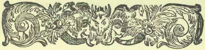
ILLUSTRATION TO VOL. X