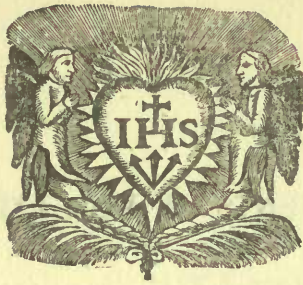
ILLUSTRATION TO VOL. LXIII